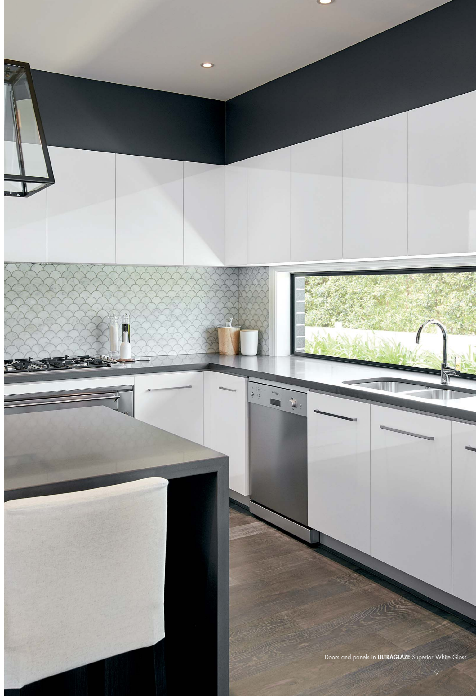
Doors and panels in ULTRAGLAZE Superior White Gloss.

For a seamless matching edge finish, available in ABS.