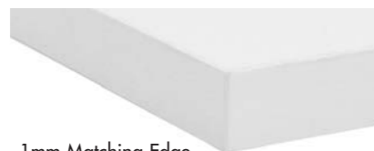
1mm Matching Edge

Designed for a sleek, modern and minimalistic look creating clean flowing lines.