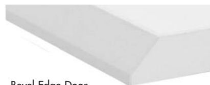
Bevel Edge Door

Designed for a sleek, modern and minimalistic look creating clean flowing lines.